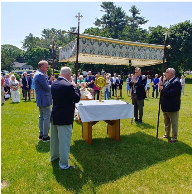
Corpus Christi Procession