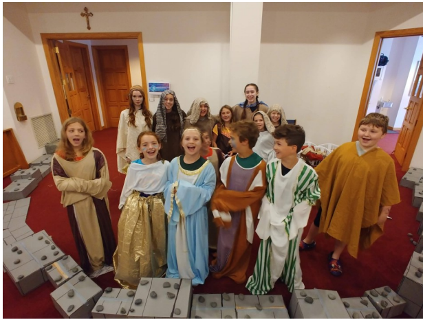
Vacation Bible School 2023